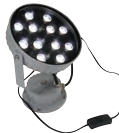
LED-COOL-WHT-BLAST Features a cool LED light output; good for darker graphic prints. 6,000K