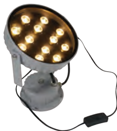
LED-WRM-WHT-BLAST Features a warm white LED light output; good for light-colored and neutral graphic prints. 6,000K