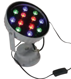
LED-RGB-BLAST Features multi-pattern flashing RGB LED light output; RGB spectrum cannot be controlled.