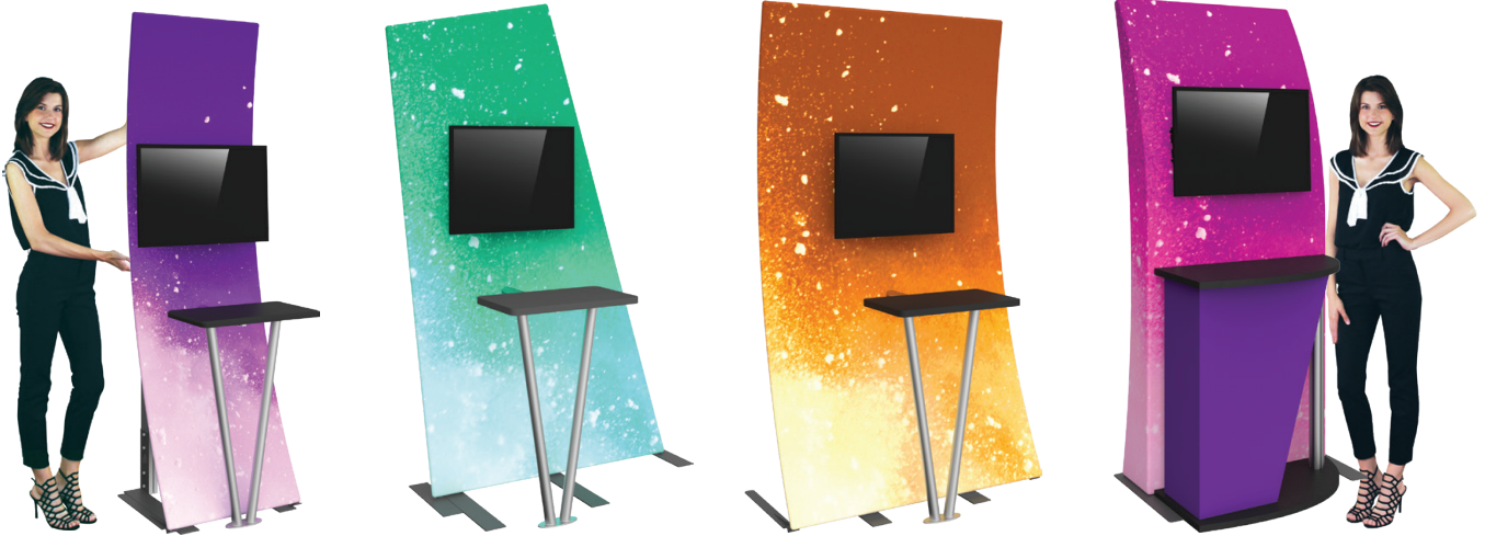
KIOSK Design 1

TensionLite Plus Kiosks couple lightweight aluminum tube frames with state-of-the-art printed stretch zipper pillowcase fabric graphics to create funky and functional Kiosks