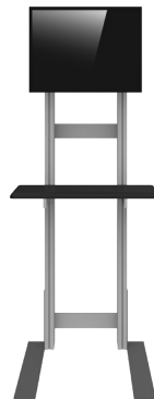
PM4S3-M-MSHELF PM4S3-M L-MSHELF