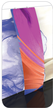
Abffla` 01 FMLT-WL01