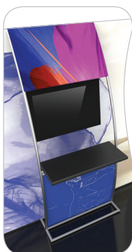
Abffla` 04 FMLT-WL04*

Features a 36" w table top, top and bottom velcro applied printed fabric graphics and hardware mounts for a medium sized monitor*