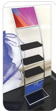
Abffla` 02 FMLT-WL02

Three 20" w shelves and top and bottom printed infill panels