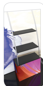
Abffla` 07 FMLT-WL07

Two 30" w shelves and a 36" w fabric counter adds space for small products to be displayed with style