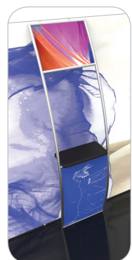
Abffla` 06 FMLT-WLC

Features a 36" w table top, top and bottom velcro applied printed fabric graphics and hardware mounts for a medium sized monitor*